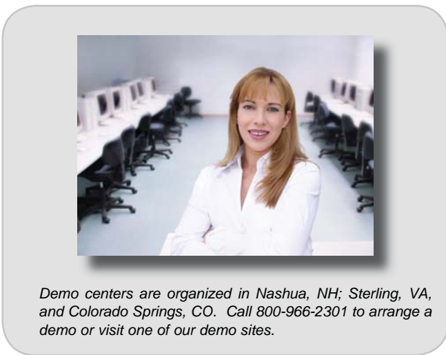
Demo centers are organized in Nashua, NH; Sterling, VA, and Colorado Springs, CO. Call 800-966-2301 to arrange a demo or visit one of our demo sites.

Shared View allows a user to share with all meeting participants any image on their desktop in a user-defined window. This feature can also be used to share, for example, a PowerPoint presentation, a photograph, or an Excel spreadsheet. Whatever is on your desktop - you can share it.